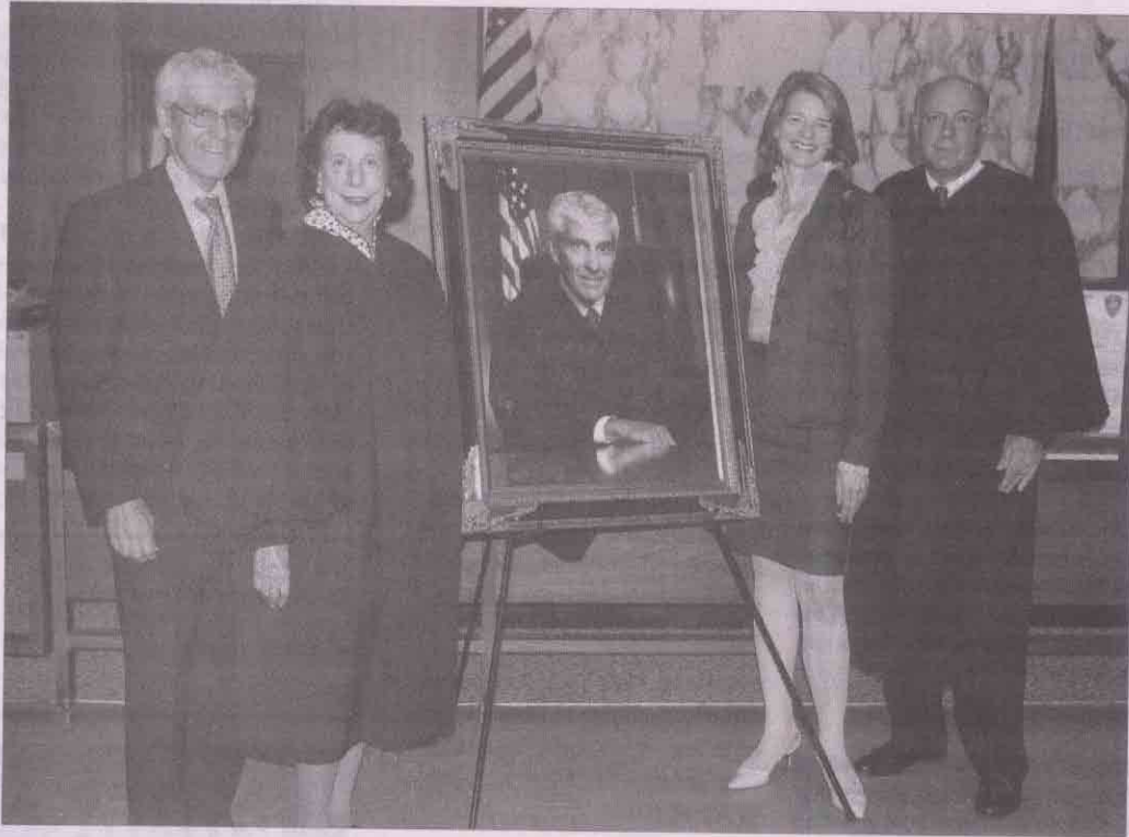
NASSAU COURTS (2)